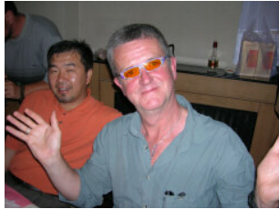
Ever the careful negotiator!

He has worked with both adult and youth groups in various areas around the world.